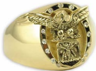
14K Gold, 13 diamonds optional

When I set out to design a ring worthy of a U.S. Airman, I knew it had to be beyond comparison. It had to be instantly recognizable, affordable to all ranks and of the highest quality. It is just that. Handcrafted, one-piece sculptures made from the finest precious metals, each ring is made to your exact size and our exacting standards. They're heavy in weight and cast solid - no gluing or electroplating, that will surely fall apart or wear off. All of my 30 designs are copyrighted in the U.S. Library of Congress. Mike Carroll