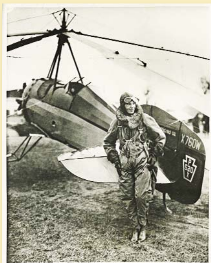
Top to bottom: Amelia Earhart became George Putnam's obsession; in Honolulu before a solo flight to California; pilot of an autogyro in 1931.